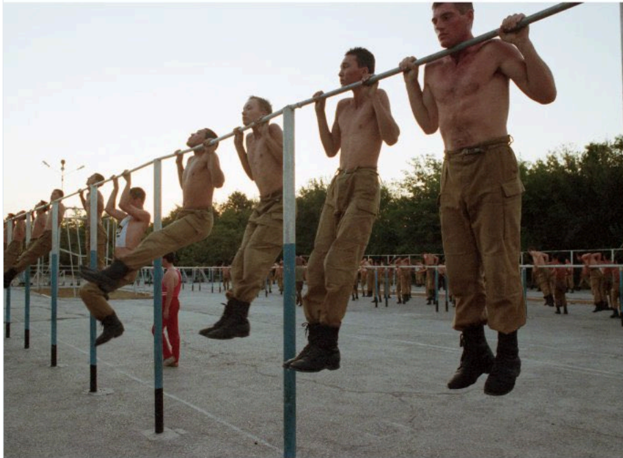
Russian soldiers train at a military camp in 1991.