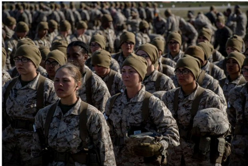
Women Marine recruits training at Parris Island in South Carolina last year.

The justices had been asked to decide whether one of the last sex-based distinctions in federal law should survive now that women can serve in combat.