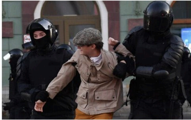
Police officers detain a man in Saint Petersburg on September 24, 2022, following calls to protest against the partial mobilization announced by the Russian President.

KYIV, Ukraine — Russia on Saturday toughened penalties for voluntary surrender and refusal to fight with up to 10 years imprisonment, and replaced its top logistics general after a series of setbacks to its seven-month war in Ukraine.