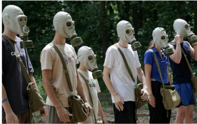
Kidnapped Ukrainian children have undergone 're-education and military training'

Research by Yale University reveals eight different types of facilities, including a military base, where the children have been held