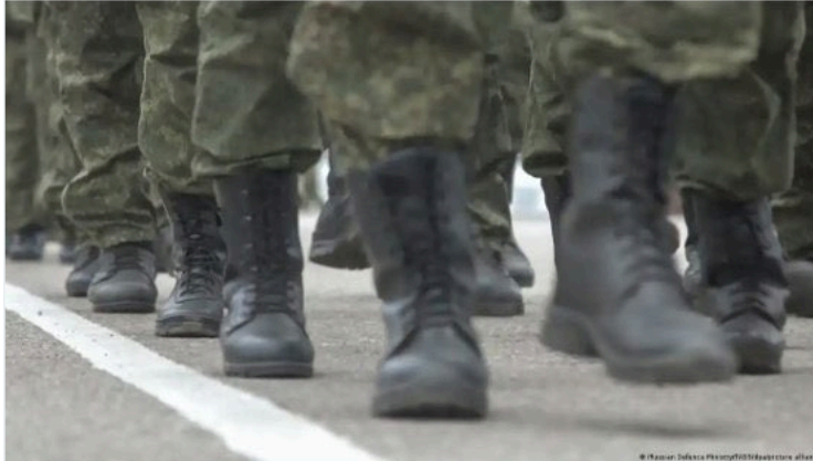
Russian army conscription is at its highest in over a decade

Forcibly conscripting soldiers to fight for an occupying power is a war crime. DW spoke with human rights activists and Ukrainians about how residents are being pressured into military service by their invaders.