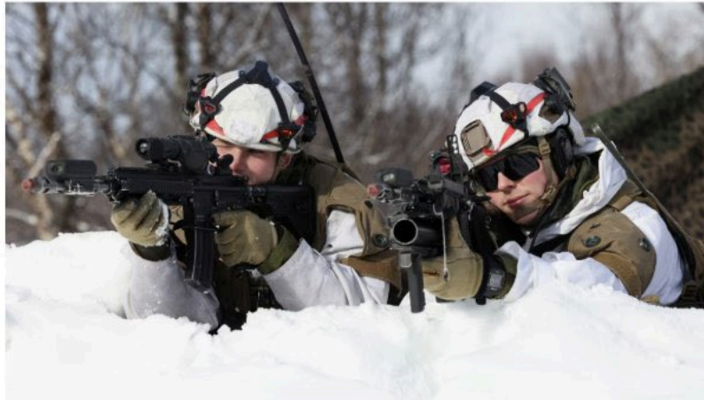
Members of the Norwegian Army participate in a military exercise called "Cold Response 2022" amid Russia's invasion of Ukraine, near Bjerkvik in the Arctic Circle, Norway, March 24, 2022.

🕒 8 min read · Published 12:00 AM EDT, Sun July 21, 2024