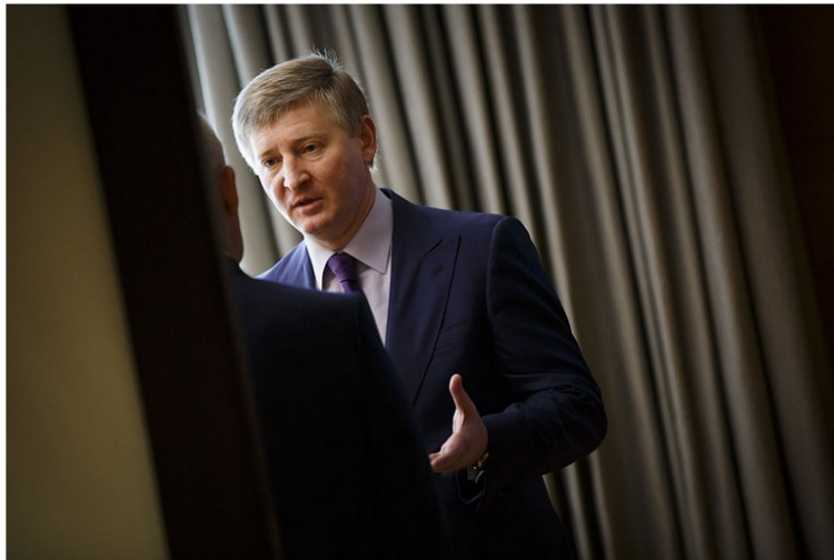
Rinat Akhmetov, a Ukrainian businessman and oligarch, waits for the arrival of German Foreign Minister Frank-Walter Steinmeier before their meeting on June 24, 2014 in Kyiv, Ukraine.

In a public statement , oligarch Rinat Akhmetov said that his System Capital Management (SCM) group is set to transfer the licenses of the television channels owned by its Media Group Ukraine to the Ukrainian government. The media holding includes Ukraina and Ukraina 24 TV channels, which before the full-scale war were among the most-watched channels in the country.