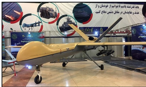
The Shahed-129 is the most used drone in Iran's fleet

In August 2022, Iran's supply of lethal drones to Russia sparked international interest and alarm. By December, Iran had reportedly supplied more than 1,700 drones capable of suicide bombings, surveillance and intelligence, and combat, according to Ukrainian military intelligence. By early 2023, Tehran and Moscow had reportedly developed plans to produce some 6,000 Iranian models at a new facility in Russia. The following is a timeline of Iran's exports to Russia and Russia's usage of Iranian drones.