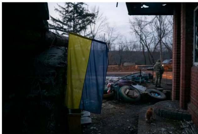
A Ukrainian flag hangs in Donetsk Oblast on Dec. 25, 2022.

During the interview, he stated that "if you don't want to be Russian, you will die. If you support the Ukrainian identity, you will have serious problems: imprisonment, death, torture."