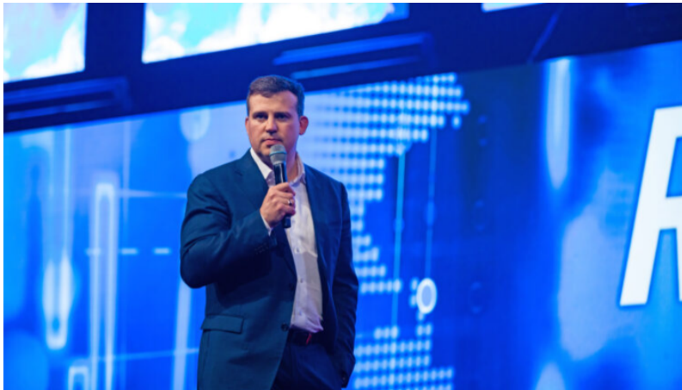
Dagcoin CEO Nils Grossberg.

According to preliminary data, this kind of activity has caused a loss of nearly 8 million euros to investors. Most of the victims are from foreign countries.