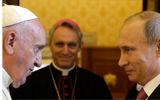
FILE - Pope Francis meets Russian President Vladimir Putin on the occasion of their private audience at the Vatican on June 10, 2015. Pope Francis went to the Russian Embassy on Friday, Feb. 25, 2022 to personally "express his concern about the war," the Vatican said, in an extraordinary, hands-on papal gesture that has no recent precedent.

ROME (AP) — Pope Francis went to the Russian Embassy on Friday to personally "express his concern about the war" in Ukraine, in an extraordinary, hands-on papal gesture that has no recent precedent. Francis later assured a top Ukrainian Greek Catholic leader he would do "everything I can" to help.