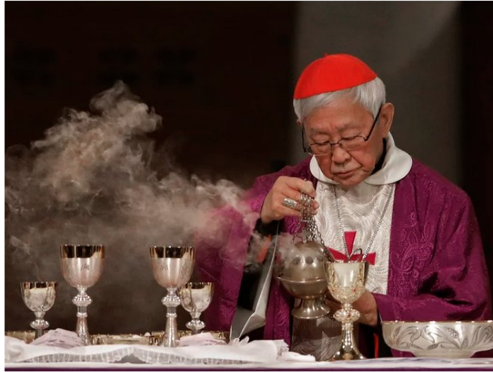
Cardinal Joseph Zen, a vocal opponent of attempts by Beijing and the Vatican at rapprochement, is shown presiding