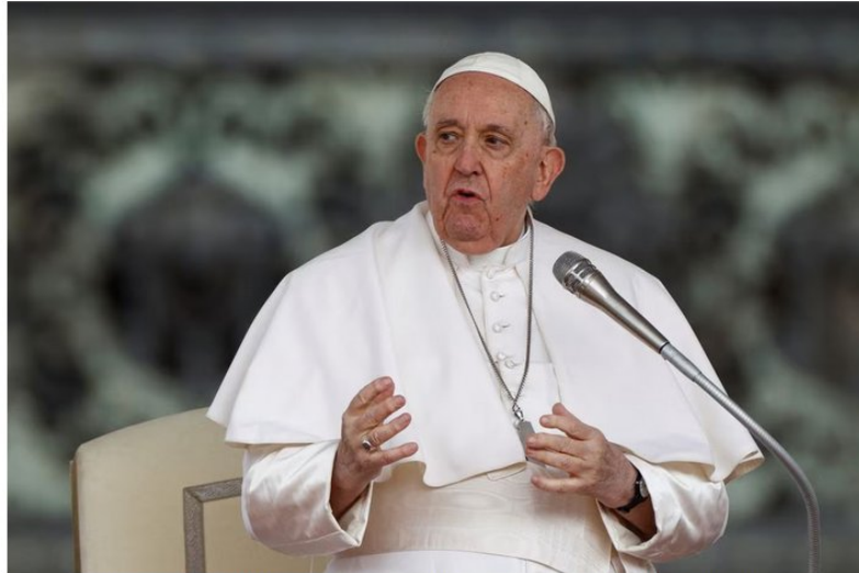
Pope Francis holds the weekly general audience in St. Peter's Square at the Vatican, March 8, 2023.

6/19 In mei 2022 suggereert hij dat de Russische invasie toch wel uitgelokt is. Hij vervolgt “Ik ben tegen het reduceren van deze complexe situatie in een situatie van een goed en fout kamp.” Ook is het de NAVO die volgens Franciscus ‘rammelde aan de Russische poort.’