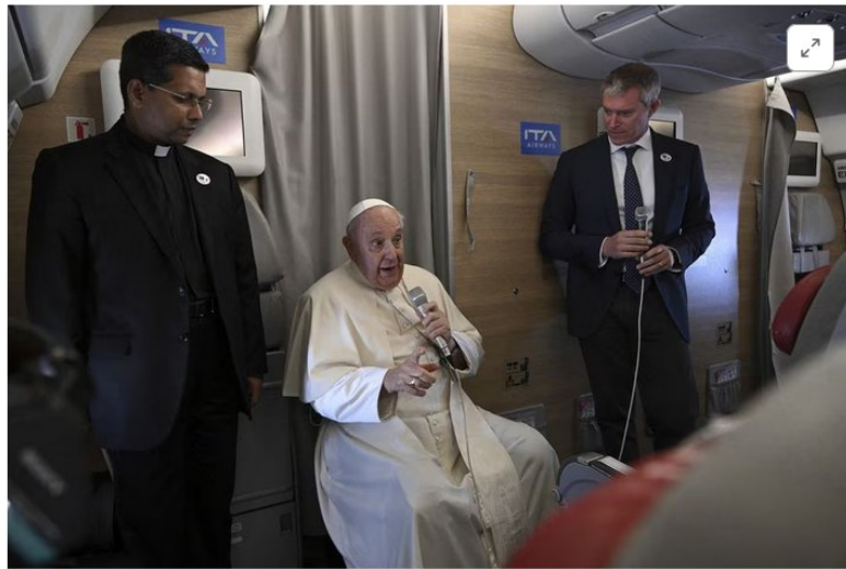
[1/3] Pope Francis holds a news conference aboard the papal plane on his flight back after visiting Mongolia, September 4, 2023.