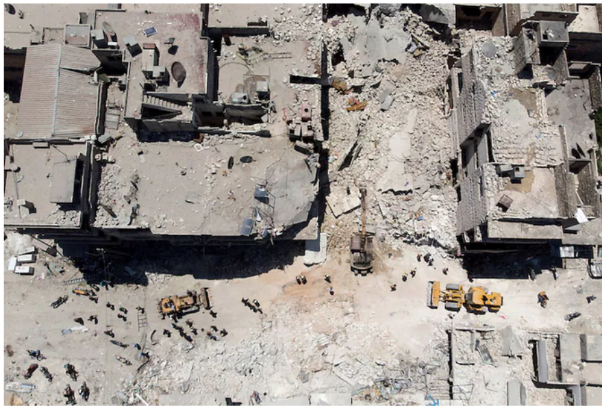
Syria Civil Defense workers, or White Helmets, search for victims after a reported Russian airstrike on Maarat al-Numan in Syria's northwest on July 22, 2019.