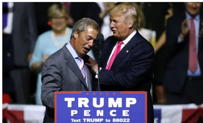
Donald Trump with Nigel Farage during a campaign rally in Jackson, Mississippi, in August 2016

Exclusive: FBI interested in former Ukip leader's ties with people connected to US president and WikiLeaks' Julian Assange