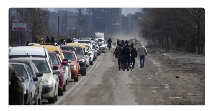
US Embassy accuses Russia of kidnapping children amid reports it's ... Officials in Mariupol alleged that Russian troops were forcibly deporting Ukrainians to Russia as attacks on Ukrainian cities intensified.

Already on 22nd of March, 2022, Ukraine and US claimed that over 2300 children had been abducted from Donetsk and Luhansk oblasts.