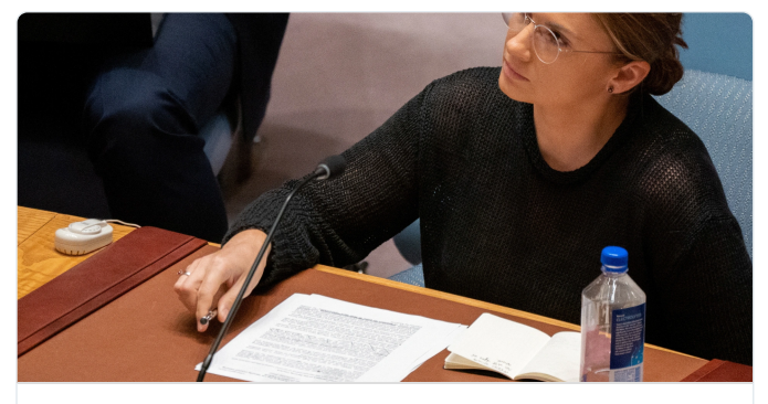
UN says 'credible' reports Ukraine children transferred to Russia US ambassador tells UN Security Council more than 1,800 Ukrainian children transferred to Russia in July alone.

UN has stated that "credible" reports have been presented that Russian forces had sent (and probably still do) Ukrainian children to Russia for adoption in a forced deportation programme.