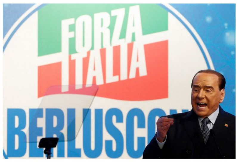
Former Italian Prime Minister and leader of the Forza Italia (Go Italy!) party Silvio Berlusconi attends a rally in Rome, Italy, April 9, 2022.

MILAN, April 9 (Reuters) - Former Italian Prime Minister Silvio Berlusconi said on Saturday he was deeply disappointed and saddened by the behaviour of Russian President Vladimir Putin.