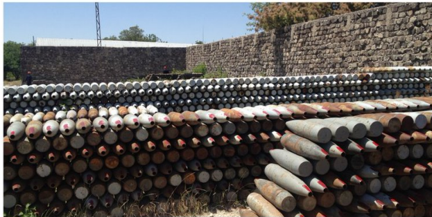
Strengthening stockpile management, including destruction, is one of the OSCE's activities in the area of arms control.