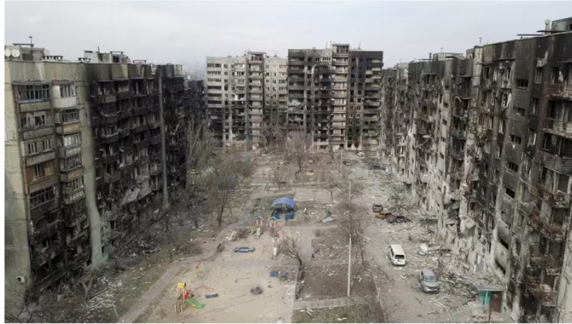
An aerial view shows residential buildings that were damaged in Mariupol, Ukraine, on April 3. A Russian state media editorial suggests the Kremlin wants to wipe out the Ukrainian identity.

Chris Brown · CBC News · Posted: Apr 05, 2022 4:00 AM EDT | Last Updated: April 5, 2022