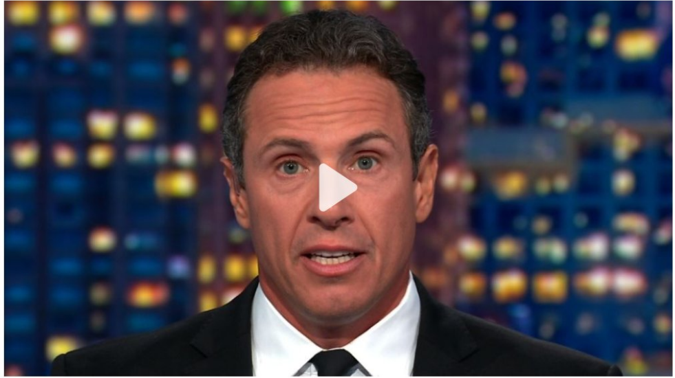
Cuomo: Why is Trump changing answer on withholding aid?