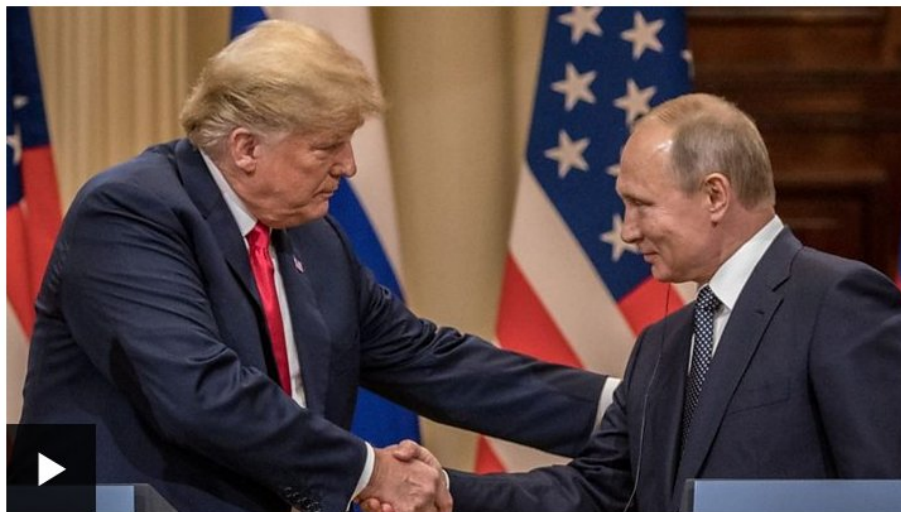
The ways Trump and Putin see eye to eye

US President Donald Trump has defended Russia over claims of interference in the 2016 presidential election.