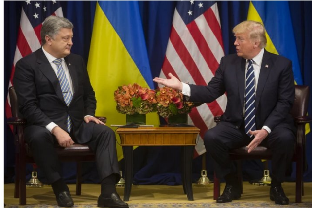
Ukrainian President Petro Poroshenko, left, and U.S. President Donald Trump meet for talks on the sidelines of the 72nd session of United Nations General Assembly on Sept. 21, 2017.

FP subscribers can now receive alerts when new stories written by this author are published. Subscribe now | Sign in